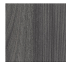
WEATHERED GREY LAMINATE