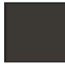
BLACK STEEL BASE