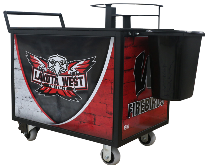
SMCH-5001 with Full Graphics Package