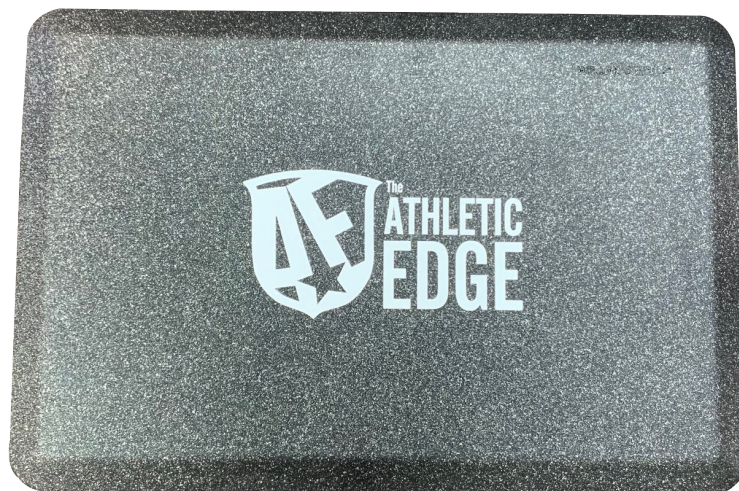
MO32 with Center Logo