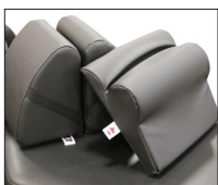
Knee & Cervical Bolster Set