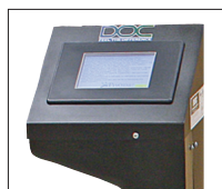
Digital Command Center with Preprogrammed Options