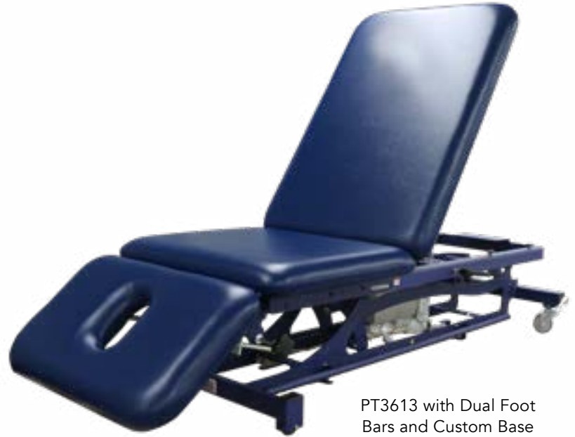
PT3613 with Dual Foot Bars and Custom Base Color

NOTE: International (240V) option available