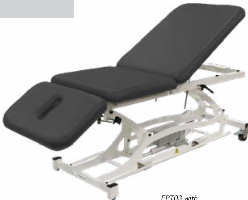
EPT03 with Dual Footbar

NOTE: International (240V) option available