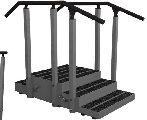
PTST-001-AHR-A with Retractable Casters